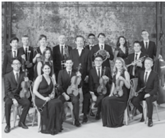
Sydney Symphony Orchestra 2016 Fellows