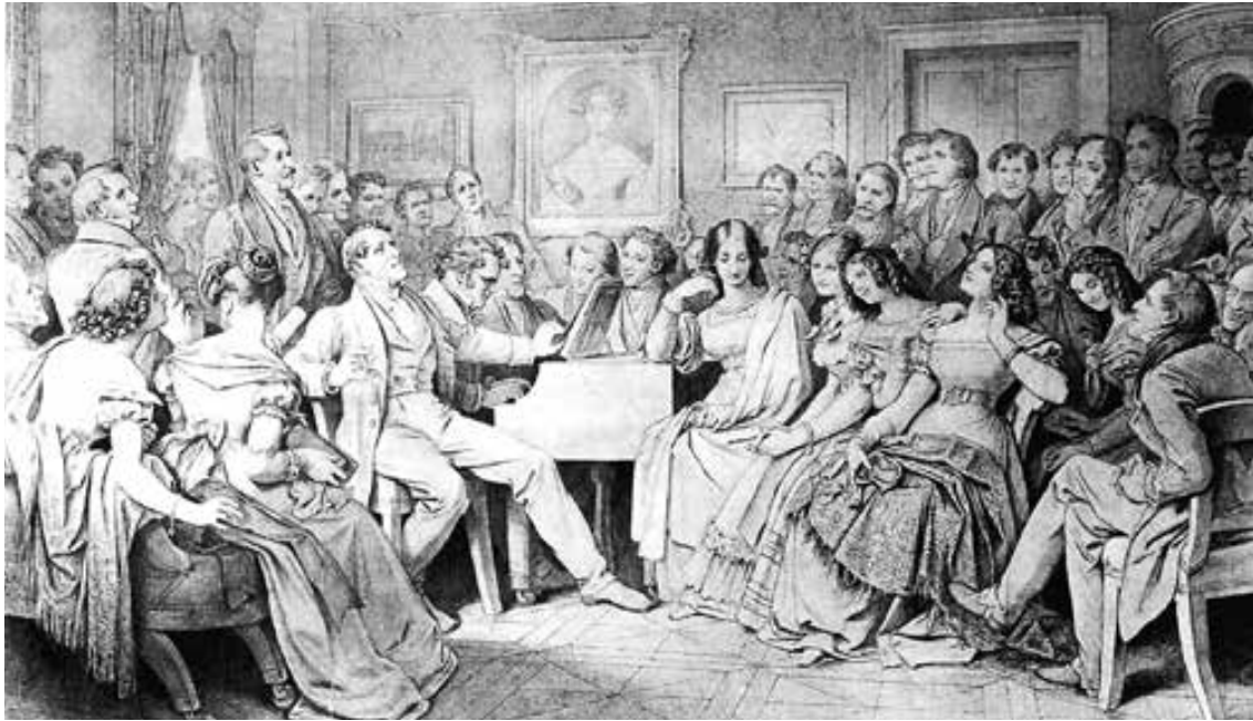
Schubert sits at the piano with baritone Johann Michael Vogl amongst his friends at a 'Schubertiade'. Drawn from memory by Moritz von Schwind in 1868.